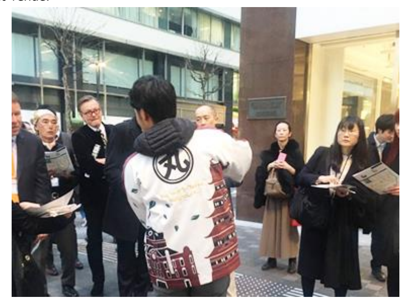
DMO TOKYO Marunouchi produced an English map and arranged guided walks for overseas delegates

The hosts requested that local government staff involved in urban development take walks to see Marunouchi's photogenic spots, so DMO TOKYO Marunouchi produced its own maps. Ten locations were selected from within the area, and attendees used their maps when walking to the closing event venue.