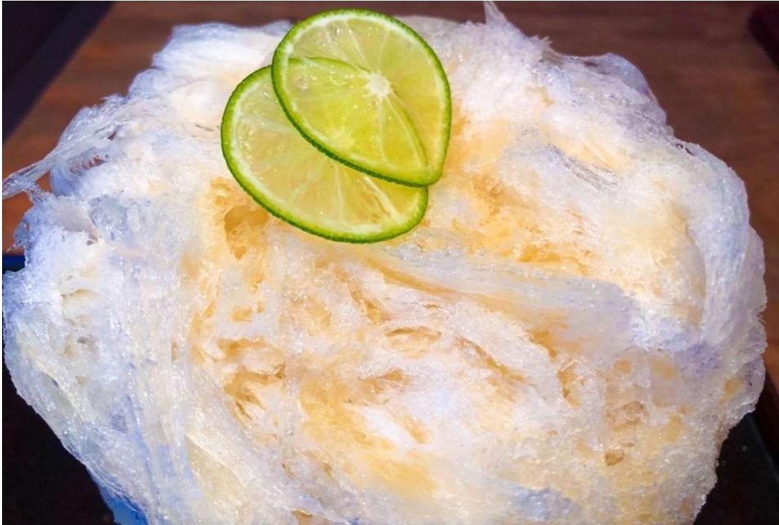
Shaved ice 'Wasanbon sudachi' at a Japanese-style sweet parlor, Inae

Sawara has also gained popularity for Japanese shaved ice in recent years. At the lovely Japanese-style sweet parlor "Inae," a renovated townhouse from around the 19th century, you can enjoy "Wasanbon Sudachi," shaved ice topped with syrup made from Japanese refined sugar.