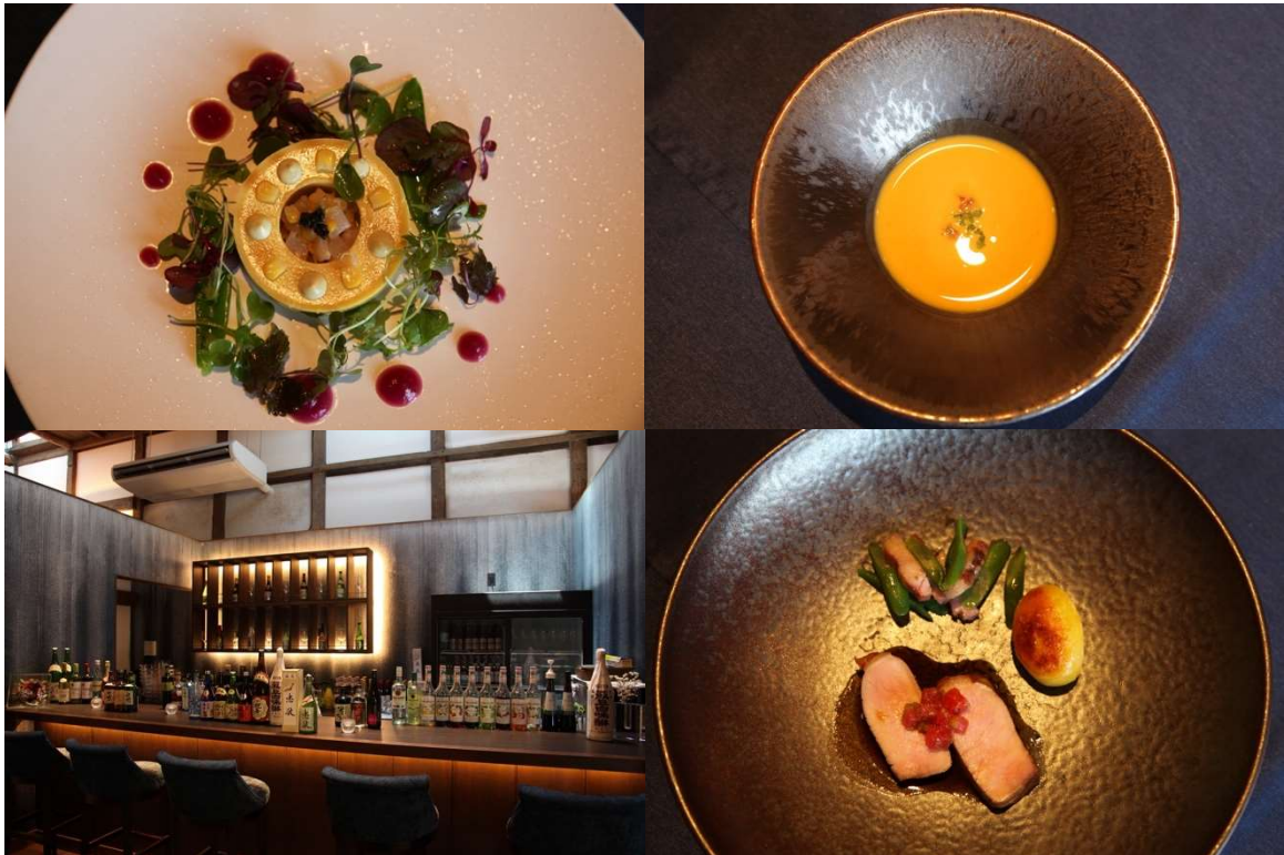
(Clockwise from upper left) Appetizers: Katori corn bavaroi with rosemary, marinated smoked scallops; Oriental-style potage of Chiba pumpkin; (Meat dish) Roasted Chiba SPF pork with warm petit salé salad Watermelon and green pepper with ravigote sauce; a bar at LE UN with a sophisticated atmosphere

At LE UN, you can taste fermented French cuisine based on the concept of “terroir et nature,” which uses fresh, local ingredients to bring out the best of their flavors. Lunch starts with a non-alcoholic mirin tonic using "Supreme White Mirin" from Baba Honten Sake Brewery. Following the appetizer and soup, there are two main dishes to choose from: fish and meat dishes or one with dessert and an after-meal drink. Here are some of the dishes you can enjoy with all your senses.