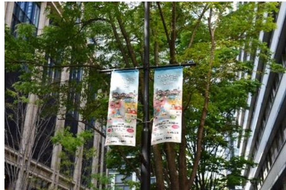
Expo flags on streetlamps on Marunouchi-Nakadori Street