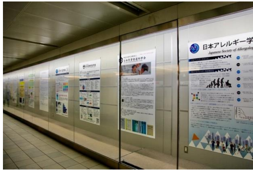
Gyoko-dori Underground Gallery

The Expo was held across a wide range of venues throughout the area, including Marunouchi-Nakadori Street, the Tokyo International Forum, KITTE Atrium, Marunouchi Building MARUCUBE, and the Gyoko-dori Underground Gallery. With events held across multiple venues, the entire area became a stage.