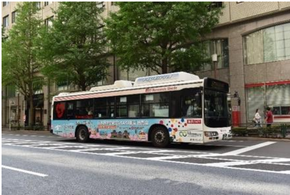
A Marunouchi shuttle bus with a wrapping advertisement banner

In addition to holding a number of exhibitions on health, medical care, and long life at each venue, a multitude of hands-on event programs were held, delighting children and adults alike.