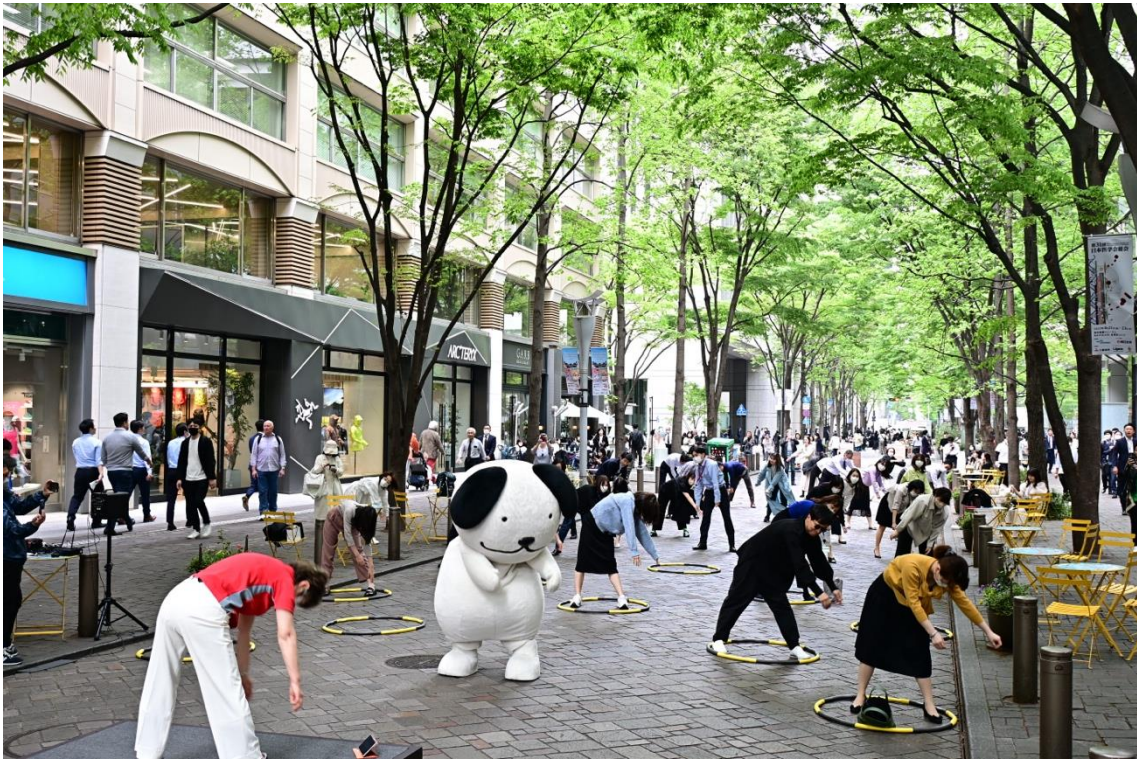
A 15-minute radio calisthenics routine - the perfect way to refresh after lunch

In addition to the “radio calisthenics” events held over spring and autumn for area workers, the event was also held as part of the Expo, attracting a large number of workers and Expo visitors alike.