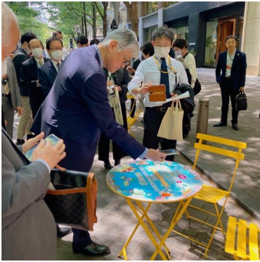
Observation tour for MICE industry figures

Over its history dating back over 120 years, this marked the first time the Congress had attempted to hold an academic conference and Expo in the same area, at the same time. The Expo ended as a tremendous success, providing an example of how an event can be staged across an entire area, leading to lively exchanges between a diverse array of people gathering in the area. DMO TOKYO Marunouchi will continue to communicate closely with organizers on events as a local co-planner to help their vision take shape, while providing support to deliver greater synergy by coordinating with events held in the area while further promoting urban area-wide MICE.