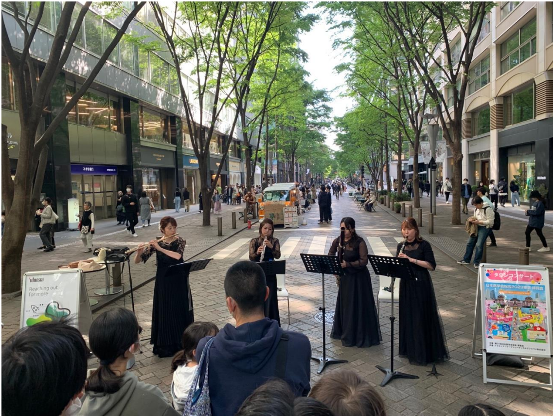
Outdoor classical music concert