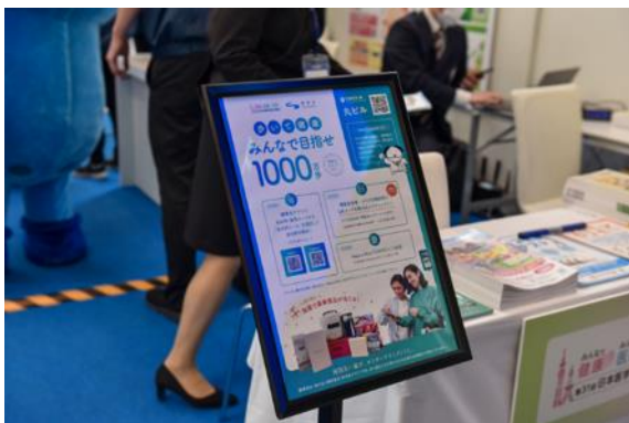
QR code for a stamp rally held at an Expo venue