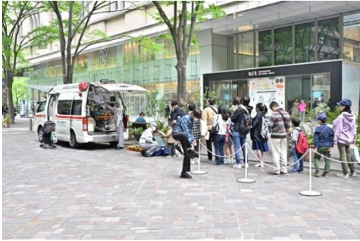
Ambulance exhibition on Marunouchi-Nakadori Street, with ride experiences for children