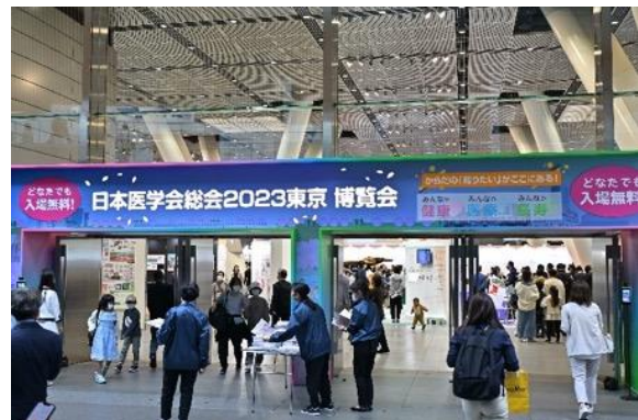
Tokyo International Forum