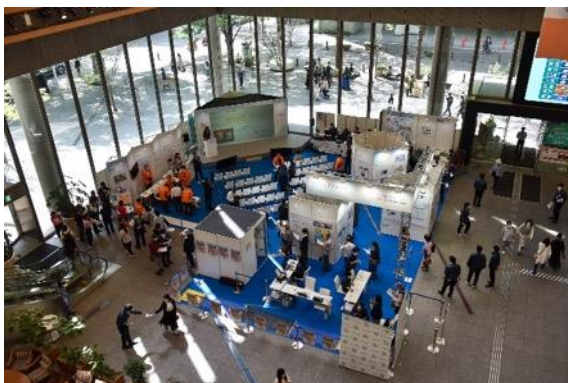
Marunouchi Bldg. MARUCUBE