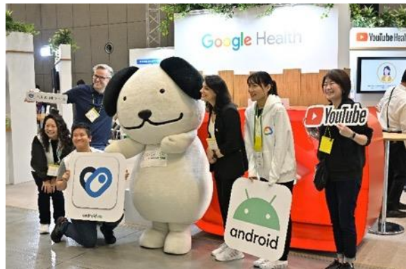
At the Tokyo International Forum. Exhibitors and Maruken

A “Walk for Health. Let’s Aim for 10 Million Steps” limited stamp rally was held in conjunction with the travel app “Hizakurige” during the Expo in an attempt to encourage visitors to get out and explore the Marunouchi/Yurakucho area. Participants scanned a QR code placed at Expo venues and stores within the area and received a prize upon reaching the finish line at “Have a Nice TOKYO!” Have a Nice TOKYO! is a tourist information center in the Marunouchi area that also functioned as a general information center during the Expo.