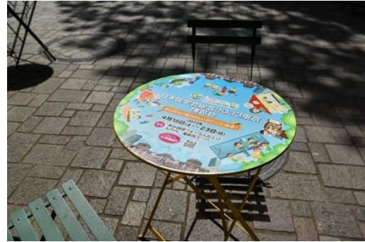
An urban terrace table adorned in an Expo design

The whole town was staged as a venue for the Expo, providing a welcoming atmosphere for visitors everywhere in the area. A unified approach was taken to dressing up the area, from the shuttle buses circling the Marunouchi area and the banner flags adorning streetlamps lining Marunouchi-Nakadori Street, to the table faces across the Marunouchi-Nakadori Street urban terrace showcasing Expo designs, making it known that events were on to both Expo visitors and general visitors to the area.