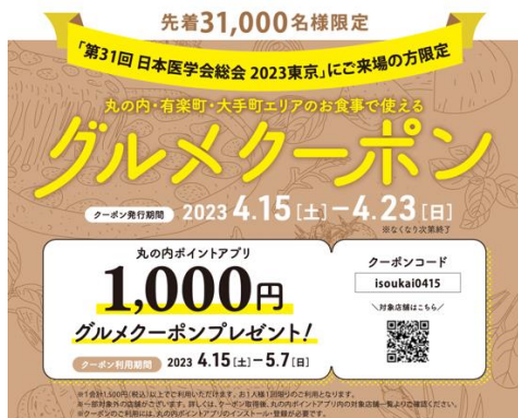
Marunouchi point app coupon