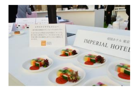
Left: Environmentally friendly "WASARA" Plate was used