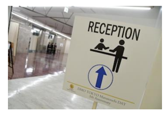
Right: Signboards that use easy-to-understand pictograms