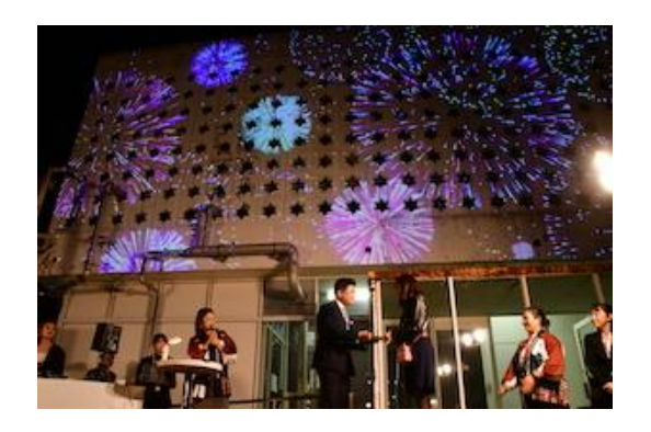
Left: DJ and projection mapping brought the venue to life