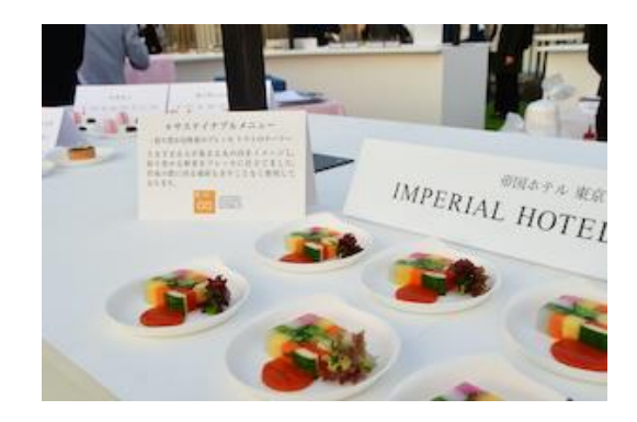
Left: Environmentally-friendly "WASARA" Plate was used