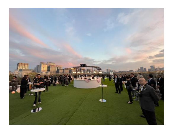
The rooftop of the Science Museum turned an event venue. Left: Before Right: After

The Science Museum is located in Kitanomaru Park, adjacent to the Imperial Palace in the heart of Tokyo. This marks our first challenge to use it's rooftop as a unique party venue for MICE. On the day of the event, artificial grass reused in Marunouchi Street Park* was laid across the roof's surface and ...a stand was set up in the center of the space. The rooftop space certainly turned an attractive party venue where guests enjoyed a pleasant conversation overlooking a spectacular city view of Marunouchi and the rich green of the Imperial Palace Garden. The rooftop space certainly turned an attractive party venue where guests enjoyed a pleasant conversation overlooking a spectacular city view of Marunouchi and the rich green of the Imperial Palace Garden.